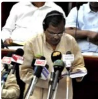
Leading Odisha CSO decries cut in social sector spending