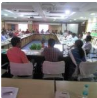
68% of anganwadis in Odisha do not have their own building !