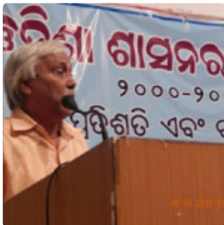
Report pats Odisha govt on Re 1 rice scheme, raps it on women's safety