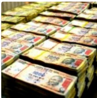
Odisha expects Rs 6000 cr more in Central aid in 2015-16